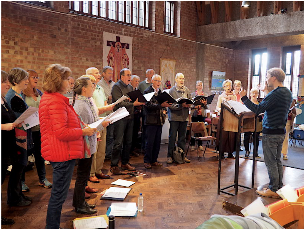
Ipswich Chamber Choir in rehearsal.

St Matthew Passion . ICC will be performing this work on 05 April 2025 at Snape Maltings and it will be the culmination of the choir's four-year Bach Cycle, performing one passion each year. Registration for the workshop starts at 10am and costs £25, under 30s £12.50. To apply visit www.ipswichchamberchoir.org.uk or for information contact ipswichchamberchoir@gmail.com